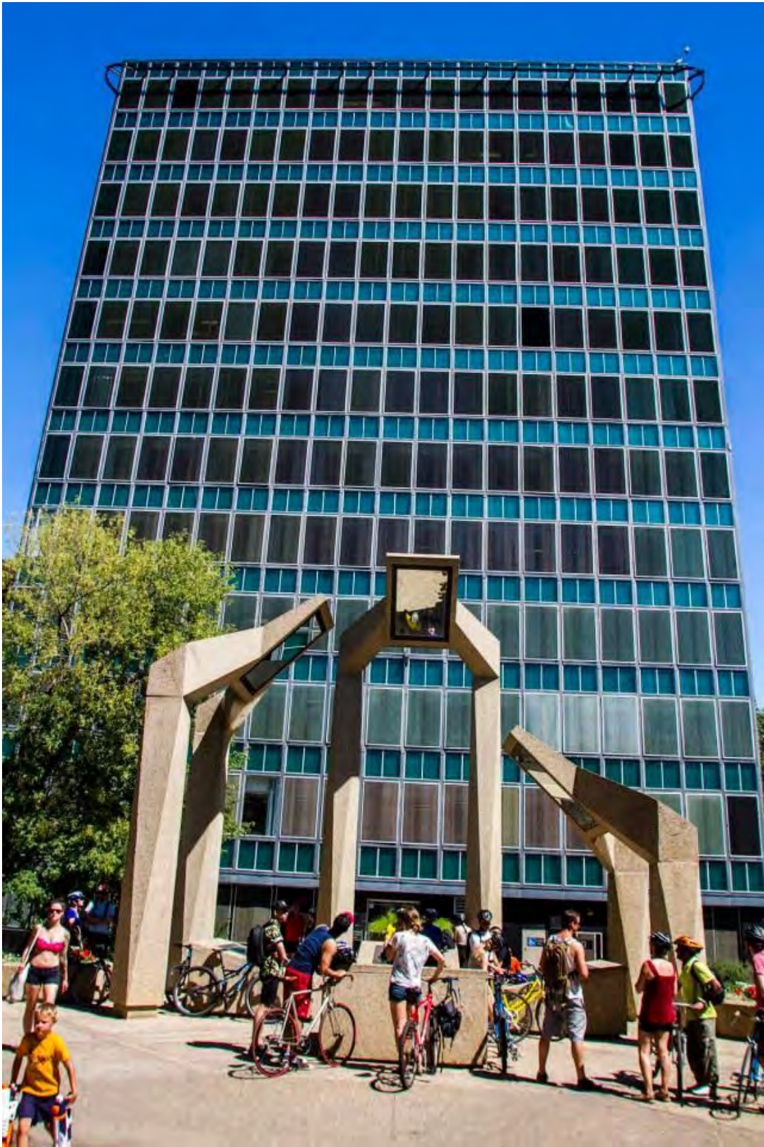
Architecture Ride led by EBC, Dialog and Manasc Isaac